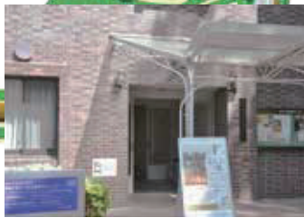
Research Center for Naniwa-Osaka Studies