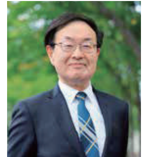
Kansai University Vice President Dean, Division of Community & Business Partnerships (Professor, Faculty of Environmental and Urban Engineering)

At Kansai University, various partnership projects are being pursued within the URA system under the Division of Community & Business Partnerships. The mission of the Division of Community & Business Partnerships is to make the diverse partnerships that Kansai University has built so far with the government, local municipalities, companies, communities, schools, and various organizations more effective while also searching for and building new connections. What can Kansai University do to contribute to the sustainable development of the global society? In order that the community and business partnership activities of the university may become a driving force that creates new forms of innovation in society, we will continue to strive to become a place for the "creation and application of knowledge" at Kansai University.