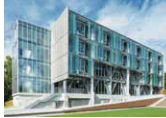
Center for Innovation & Creativity