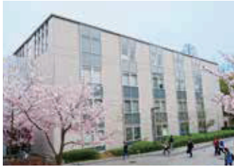
Center for Business, Government & Universities Center for Intellectual Property