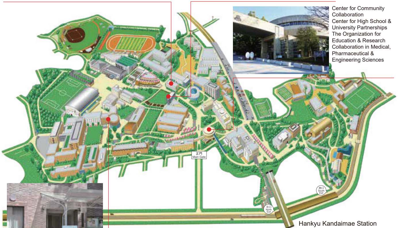
Center for Community Collaboration Center for High School & University Partnerships The Organization for Education & Research Collaboration in Medical, Pharmaceutical & Engineering Sciences